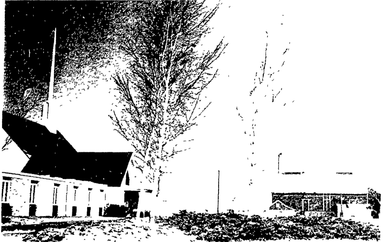
SEASONAL SIMILARITY: This photo depicts a striking similarity between two different structures - the Forest Hills Mennonite church along Quarry Road, Leola, Lancaster County, in the foreground and the barn in the background. Both have spires reaching skyward -- one a steeple and the other a silo. The high-pitched roof angles are repeated in

MOSTLY - The majority of sale or volume. UNDERTONE - Situation or sense of direction in an unsettled market situation.