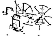
TECUMSEH Condensing Units