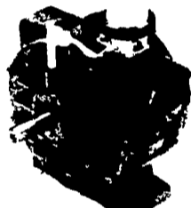
Americas Nu-Vac Basic Pumps