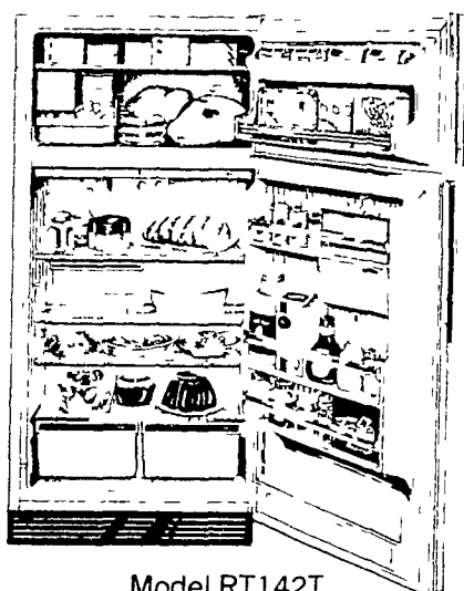
Model RT142T WHITE WESTINGHOUSE 14.8 Cu. Ft. "ENERGY SAVER" REFRIGERATOR-FREEZER

Rt. 501 South of Myerstown — On The Square in Reistville Phone 717-949-3006