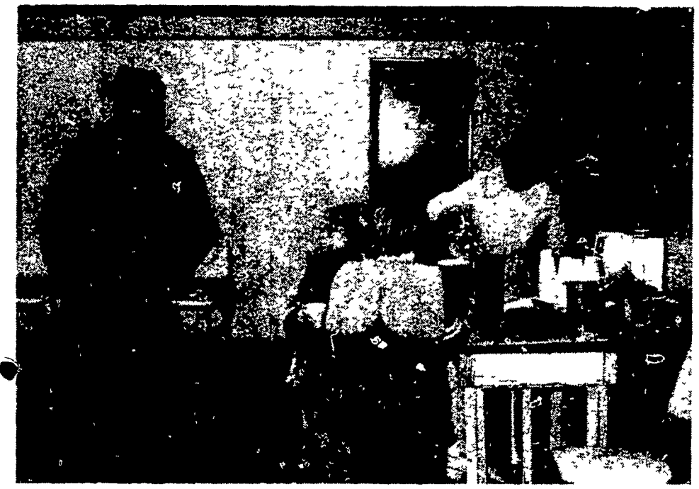
Christman hospitality at Ro-Ria Farms included giving hot chocolate and