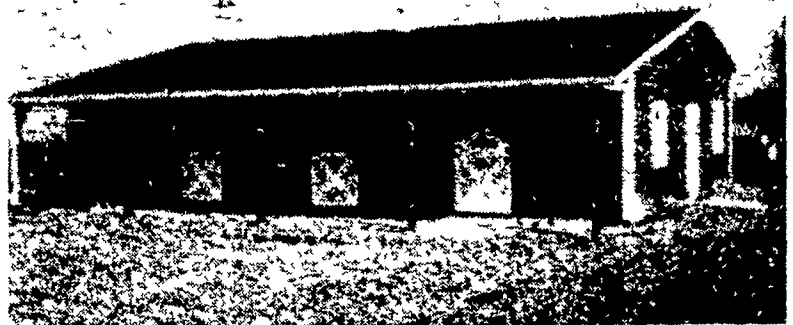
Backyard Horse Barn

We Have A Skilled Crew Available For Erection if Desired