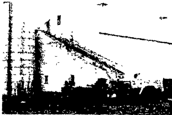
HYDRAULIC AERIAL EQUIPMENT