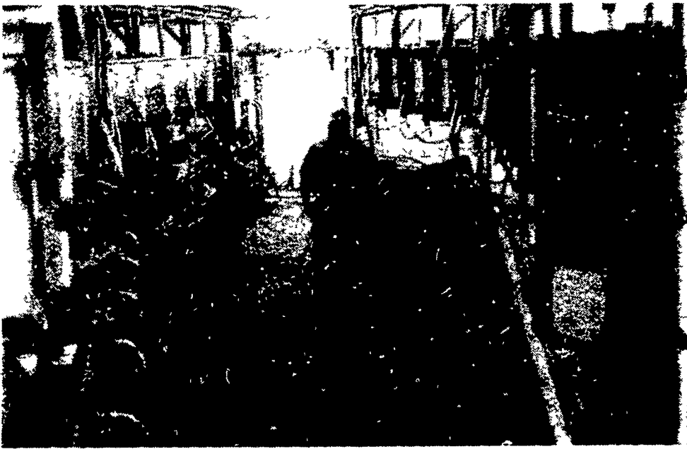
Workmen finished their chores early in September at Fair Hill farm. Construction had started on April 6, according to Ed Frey.