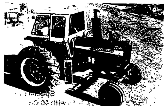
IH - F1456D, 1971, Cab 2800 Hours, New Clutch, Excellent