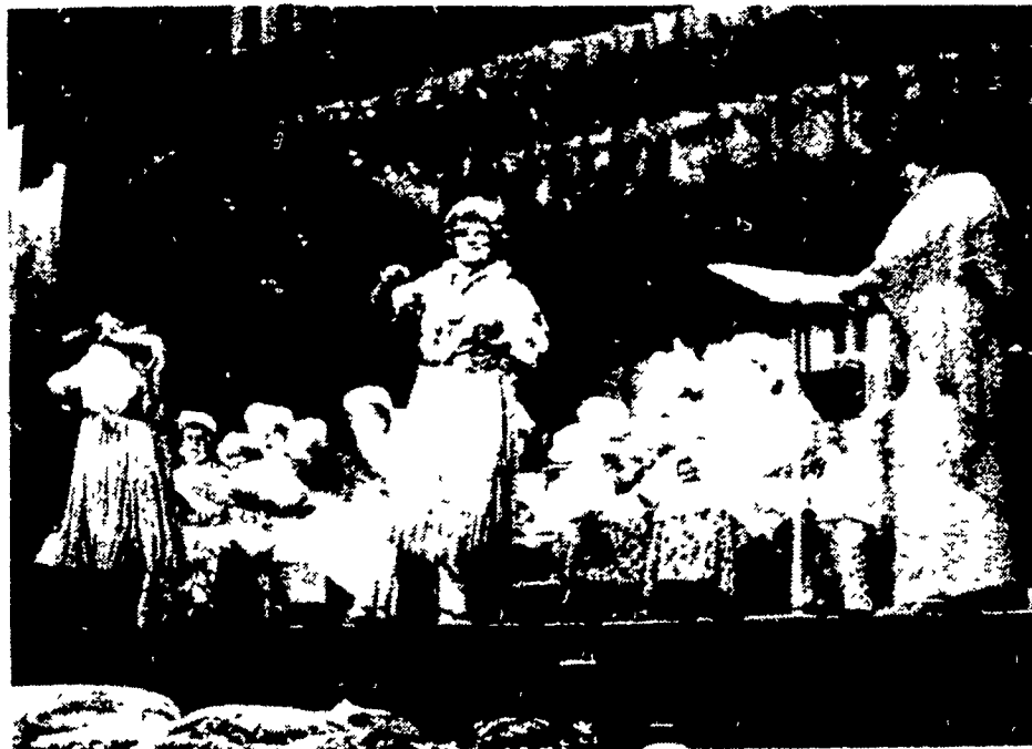
The AARP Kitchen Band of Hanover performs the "bubbles" number.