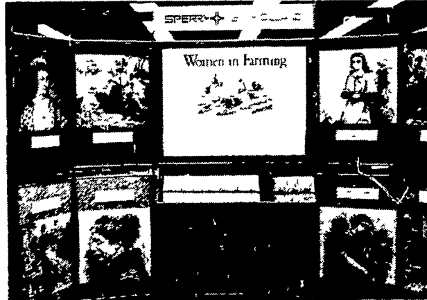
Sperry New Holland furnished this display at the American Agri-Women convention depicting the history of the American farm wife. This and other displays were on exhibit for the women Monday and Tuesday.