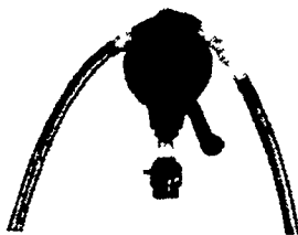
Model 112 ROTARY HAND PUMP $75*