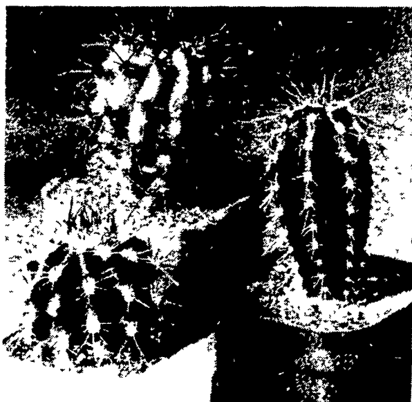
Cactus is a treat gardeners of all ages can grow indoors that's fun, foolproof and carefree. These are a sample of Burpee Seed's cactus selection.

DOYLESTOWN — What can gardeners of all ages grow indoors that's fun, foolproof and carefree? "Cactus", says Jeannette Lowe, Burpee Seed Company horticulturist and indoor gardener. "We've had a pot of cactus growing on our office window sill in bright sunshine over a radiator for several years and these plants are certainly thriving on neglect." Once cactus seedlings are up and growing, you can forget about them. These desert denizens like dry air and heat from radiators or vents. This arid atmosphere, prevalent in most homes during winter when furnaces are running, is difficult for many other types of houseplants but ideal for cactus.