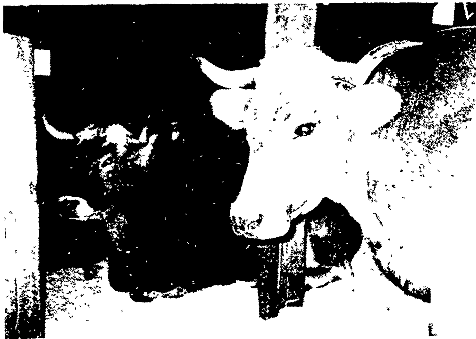
What big steers you say? Not quite. These two over-sized pet oxen sold for 45 cents a pound at the New Holland Sales Stables on Thursday, October 30. The one on the left weighed in at 2460 pounds while the one on the right weighed 2700. They were sold to a packing company in North Carolina.

SADDLE UP! To Better Equipment... Find It In Lancaster Farming's CLASSIFIEDS!