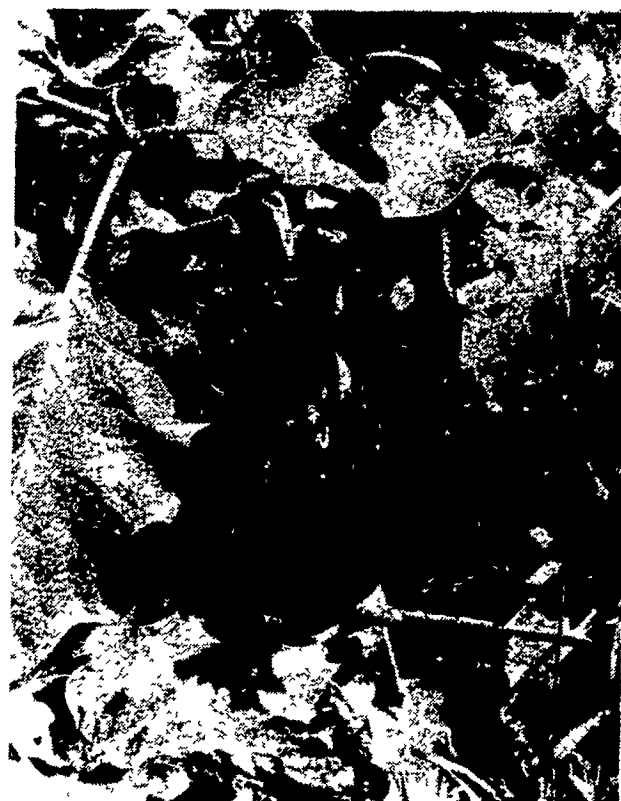
Eggplants grown on raised beds with trickle irrigation could be profitable for small farmer, provided markets are lined up ahead of time.

Eggplant can be harvested for fresh sale once or twice a week over a three-month