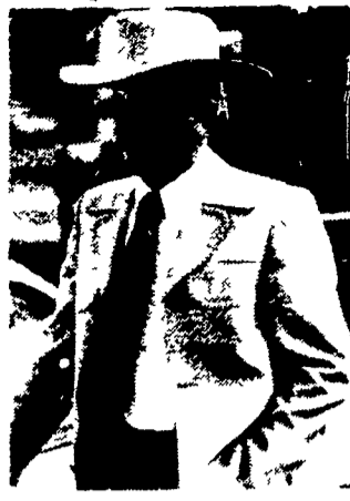
THE DETROIT CONNECTION

ALL BRAND NEW 1980 and 1981 DODGE CARS & TRUCKS • K-KARS • OMNIS • VANS • PICKUPS JACK'S PRICES ARE GOING DOWN!!