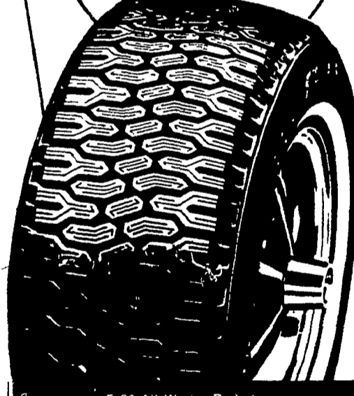
F-32 All-Winter Radial For winter traction without metal studs