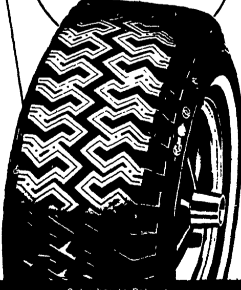
Suburbanite Polyester Deep-biting smooth-riding polyester tire