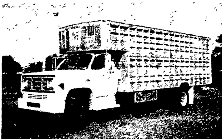
Aluminum Livestock Body

Manufacturer of All Aluminum Truck Bodies Livestock, Grain & Bulk Feed