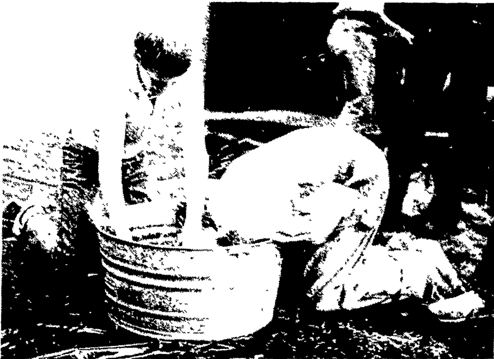
Green hands go through initiation at the annual initiation program, Ephrata High School.