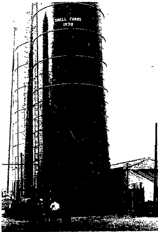
Large Harvestore on the Snell farm at Auburn, Ill. provide mountains of high moisture corn needed for 680-sow operation.

"Also, we must contact the state each time we sell pigs