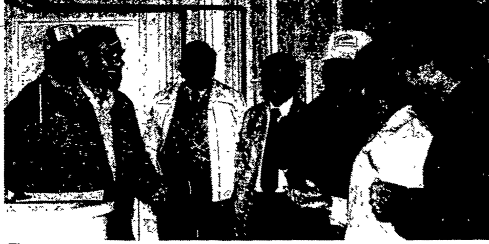
There are smiles all around as Agway sales study group discusses ethanol still operation on research farm.

Broiler-fryers slaughtered in Pennsylvania under federal inspection during the week ending October 1 totaled 1,813,000, with an average liveweight of 4.02 pounds.