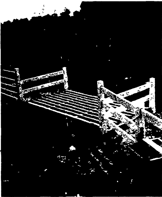
The Smith Cattleguard ®