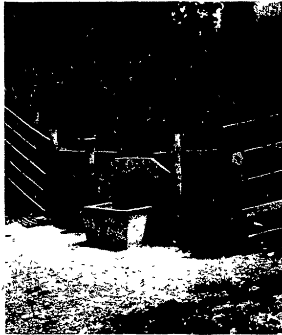
The Automatic Freeze-Proof Waterer