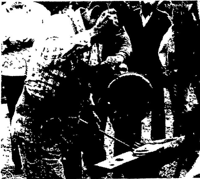
The blacksmith today might not be found with a shop in a livery stable but the hammer, anvil, and red hot iron are still familiar sights.