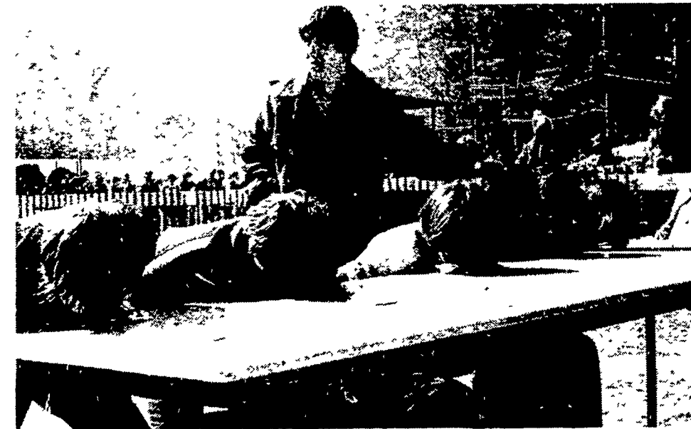
Youngsters partake in a fun but messy game — an apple pie eating contest to honor the fruit of the day.