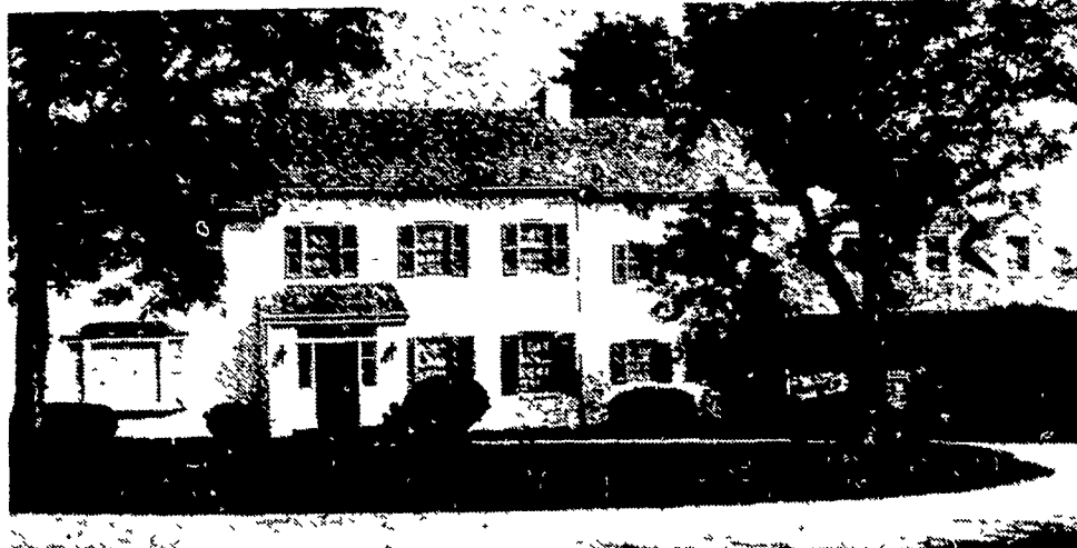
The only remaining portion of the original Redding house is the small section which contains the kitchen. It is sandwiched between two new wings, the stone section to the right with den and guest rooms and the larger section to the left of the original chimney.