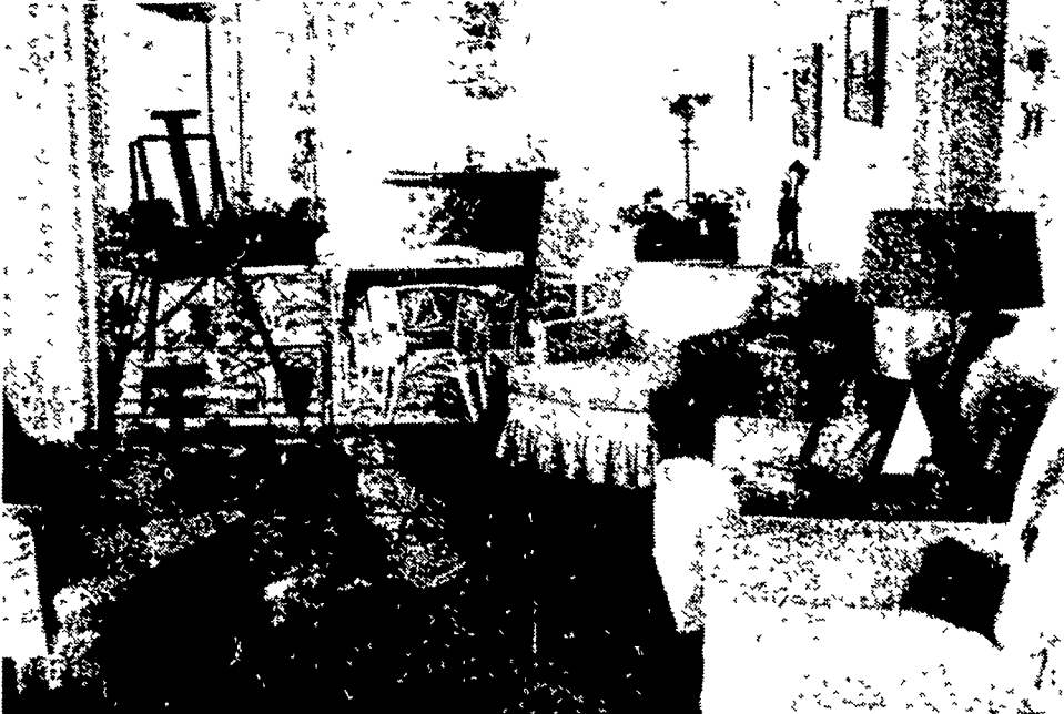
The sun porch was the Eisenhowers' favorite room. Here they relaxed and watched television, ate their meals, and read. Ike enjoyed oil painting and he spent many hours at this easel.