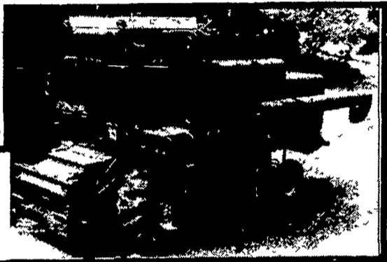
DEERE 6600 DIESEL 1974, 6 row cornhead.