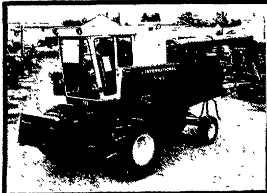
IH 915D HYDRO 1976, 1331 hours, 28Lx26 tires, Monitor 863 cornhead, 810 15' platform