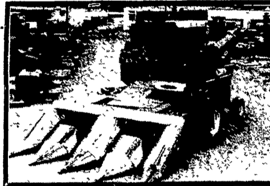
NI 704 UNI-SYSTEM 717 combine w/3 row cornhead.