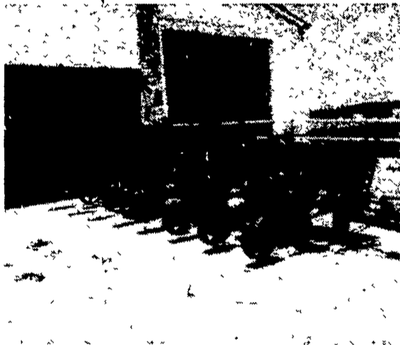
John Deere 894 8 Row 30" Planter A-1 Shape ..... $2,350.00