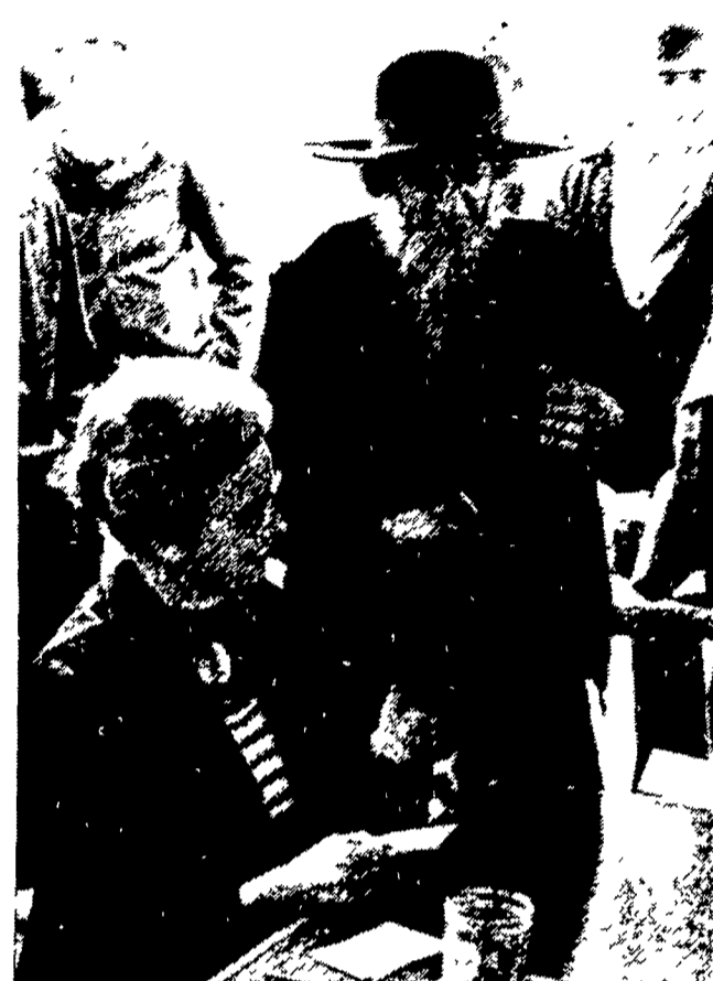
Another guess is submitted on total sale price to win prize of 50 silver dollars.