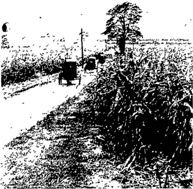
Buggies move along farm lane just prior to start of sale.