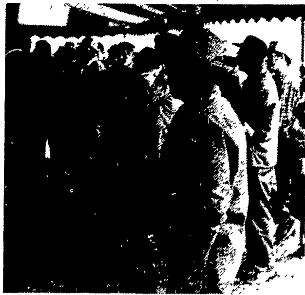
Chewing on a leaf can help calm the suspense of bidding.