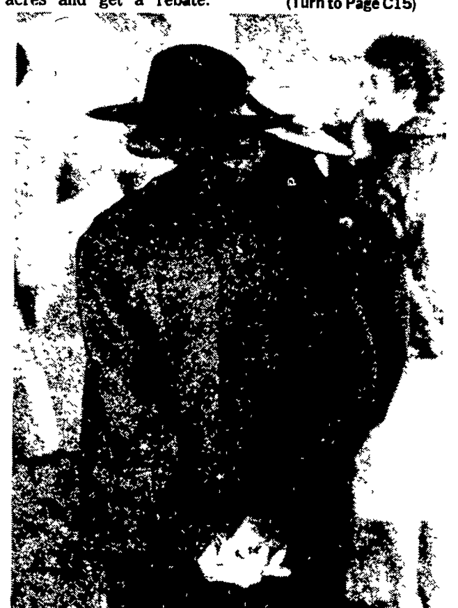
At a near half-million-dollar sale it's best to keep your hands hidden from view if you're not interested in bidding

acres and get a rebate." (Turn to Page C15)