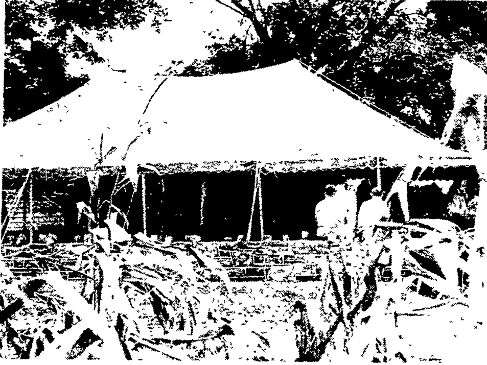
Large striped tent stands on front lawn awaiting start of farm auction. reesessesies.