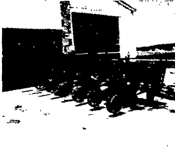
John Deere 894 8 Row 30" Planter A-1 Shape ..... $2,350.00