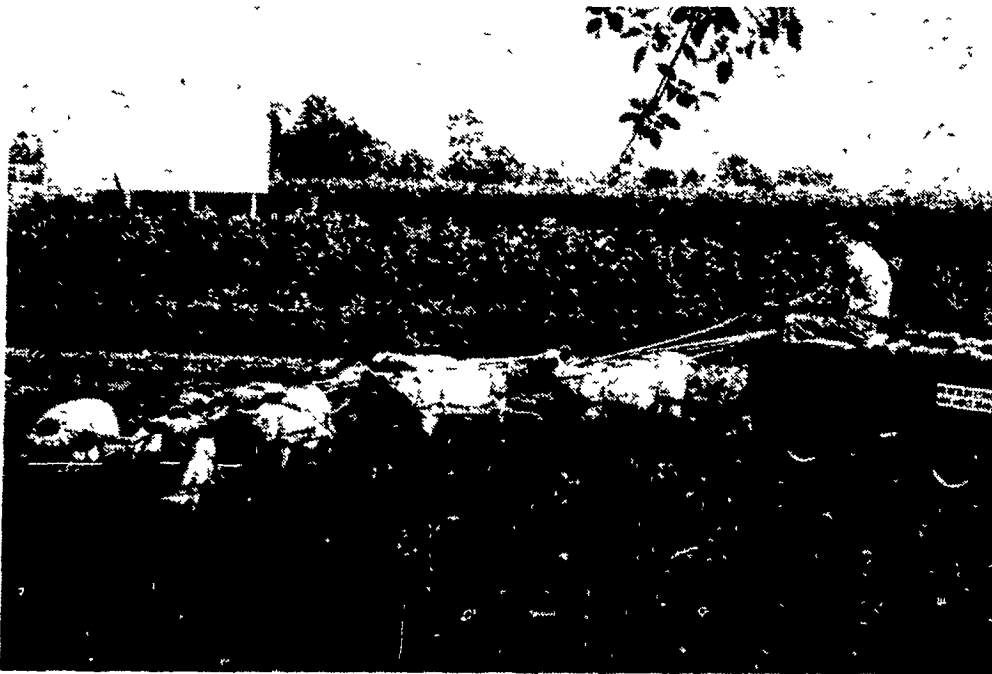
Edwin Etzler steers his eight hitch sheep driving team in a practice run on their home in Van Wert, Ohio. The Etzler's will be performing at the Keystone International Livestock Exposition at the Harrisburg Farm Show Complex October 3 and 4. The Exposition runs October 2 to 6.