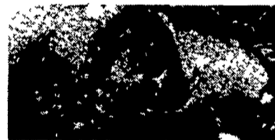
Liver and intestinal tract show no indication of excessive parasite damage