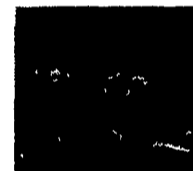
Lungs show no evidence of mycoplasma pneumoniae, or parasite damage