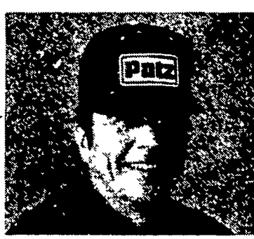
You know the problems caused by hard packed and frozen silage. Patz gives you two solutions to the problem — the Model RD-790 ringdrive silo unloader and the Model 98B surface-drive silo unloader.

Both unloaders feature a double-hook gathering chain with hardened steel cutters and claws that rip through frozen and packed silage. When you push the button, you know you can count on a smooth feeding operation.