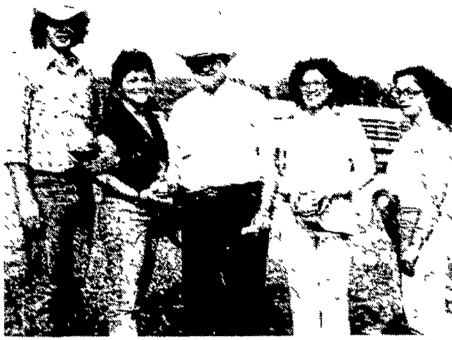
The first place judging team was from York County.