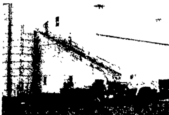
HYDRAULIC AERIAL EQUIPMENT