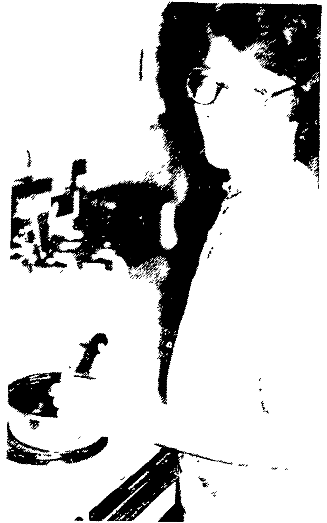
Renee enjoys working in the kitchen. This year she had an international foods cooking project which she found very interesting.