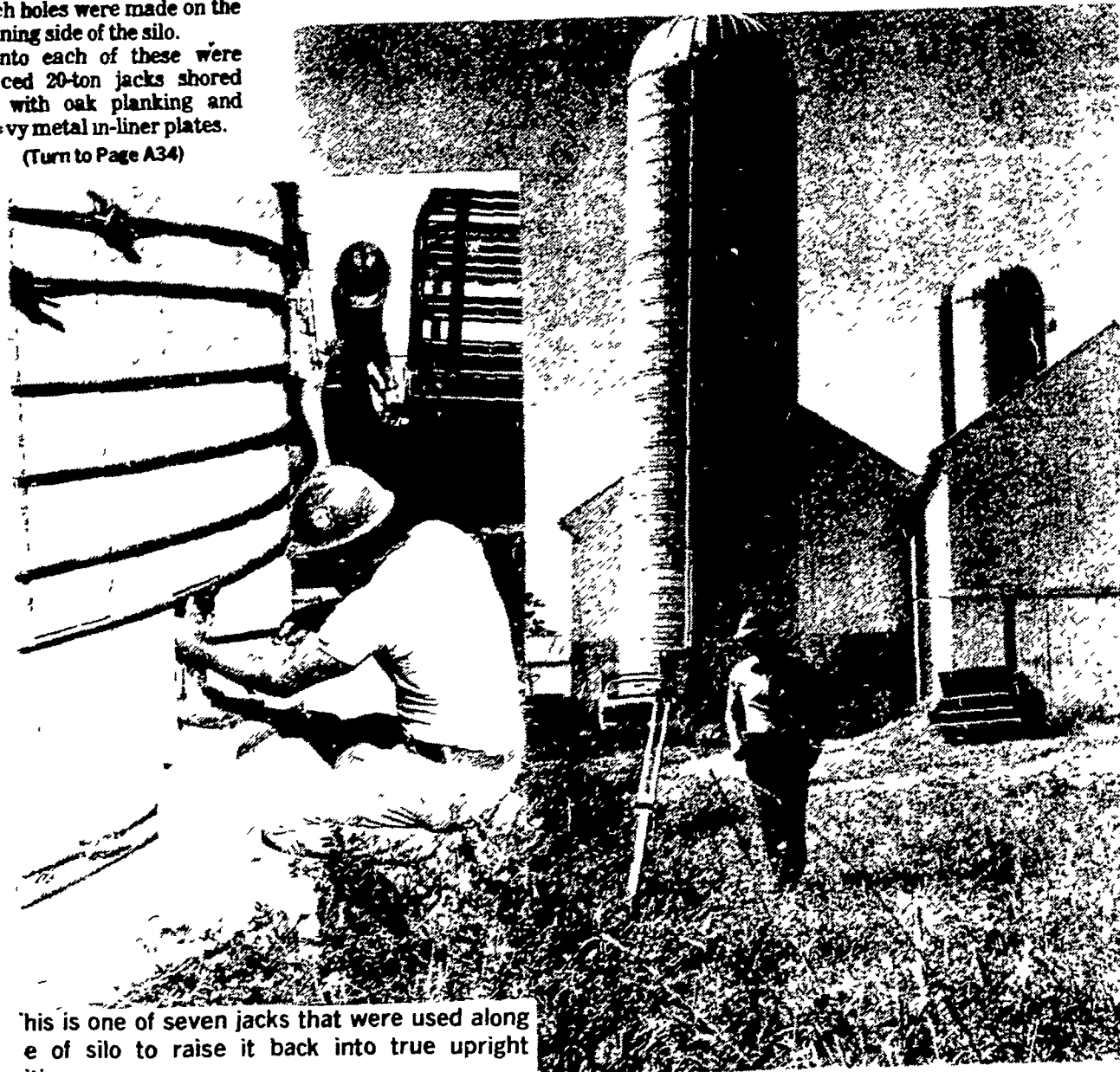
This is one of seven jacks that were used along the base of silo to raise it back into true upright position.