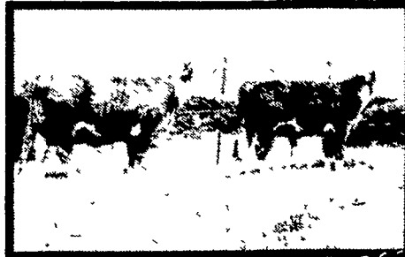
LOT 88 Sam Donald Dam Bull Calf by Li Spur