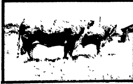
LOT 242 Britsher Dam Bull Calf by Li Spur