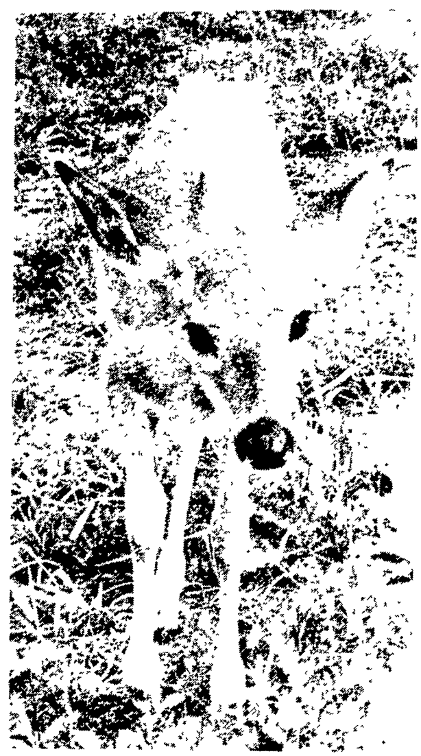
Family's pet fawn