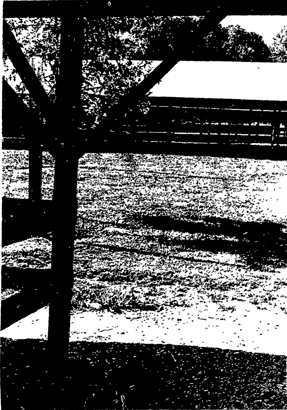
The livestock buildings at the Solanco Fairgrounds are swept and silent. Like the calm before the storm, their peaceful shady space will be invaded by a hurricane of youngsters and animals during this week's fair.