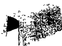
FIBERGLASS CALF HUTCH