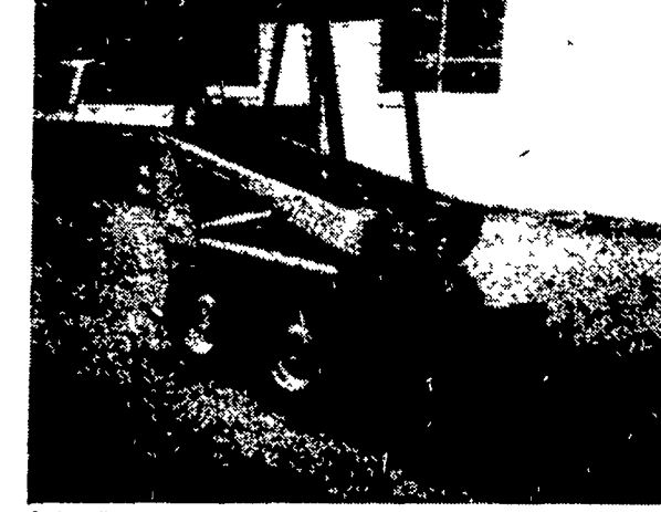
John Deere 14 Skid Steer Loader w/2 buckets, 287 hrs. ..... $5,500.00

Southdown competition Tuesday at Maryland State Fair.