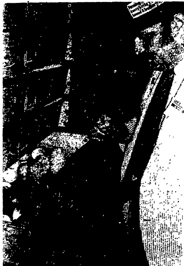
Hi there, little fellow. If you wouldn't have been so slow, you'd be on your way already.

All in all, it was a bird's eye view of the agricultural industry that now ranks first in ag sales in Lancaster County.