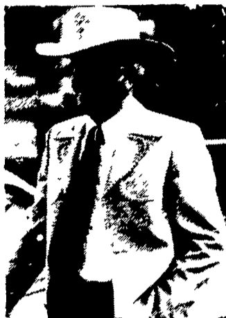
THE DETROIT CONNECTION

FROM NOW UNTIL SEPTEMBER 9, 1980 COME IN AND WE'LL SHOW YOU THE INVOICE