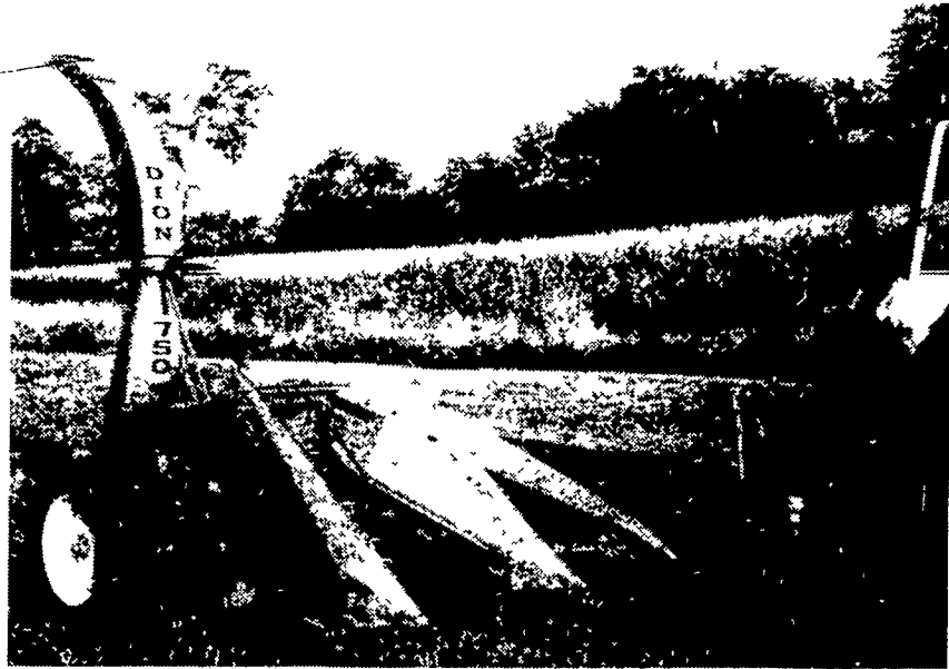
MODEL 750 IN STOCK

ITS SECOND TO NONE CUTTING - THROWING SYSTEM AND ITS EXCLUSIVE FEATURES MAKE IT THE FIRST!