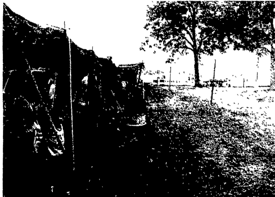
Rain forced crowds to desert Main Street at Ag Progress Days from 1:30 to 2 p.m. on Wednesday. But all those anxious faces peering out from the sides of the tents were looking for the first sign of a break in the weather. Rain only increased traffic past inside exhibits and settled dust on the roads.