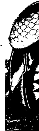
A new pe... Don't let th... quite benig... Days.