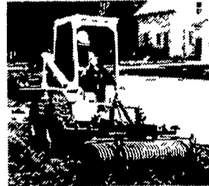
BUY OR RENT a variety of buckets and other attachments Bob Tach locks them on fast and solid