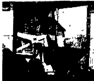
THE BOBCAT comes as narrow as 35" is built low to work in tight areas turns full circle in its own tracks