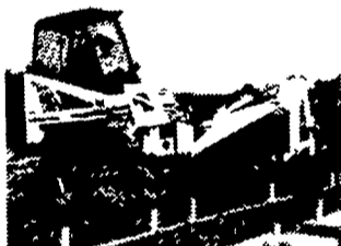
TURN THE BOBCAT into a backhoe forklift grapple too Does the work of many one-job machines