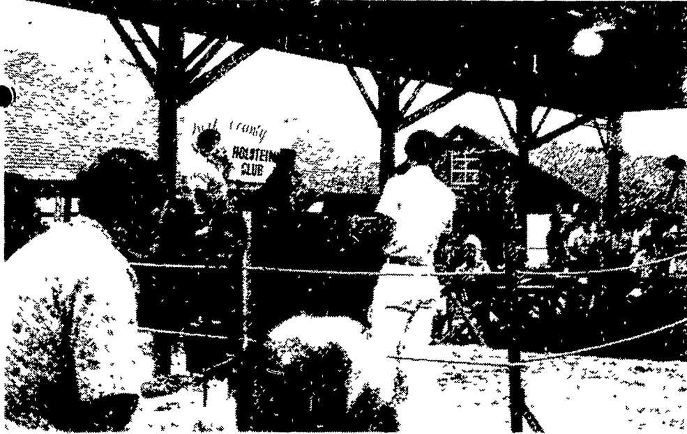
Bidding was brisk at the Berks County Holstein club sale where 27 cows and one bull sold for an average $1905.