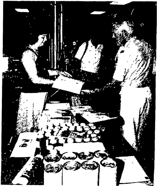
Along with natural foods and information on becoming a vegetarian, the display area at the Natural Living Convention offered this water distilling unit which processes water at a cost of 15 cents per gallon.