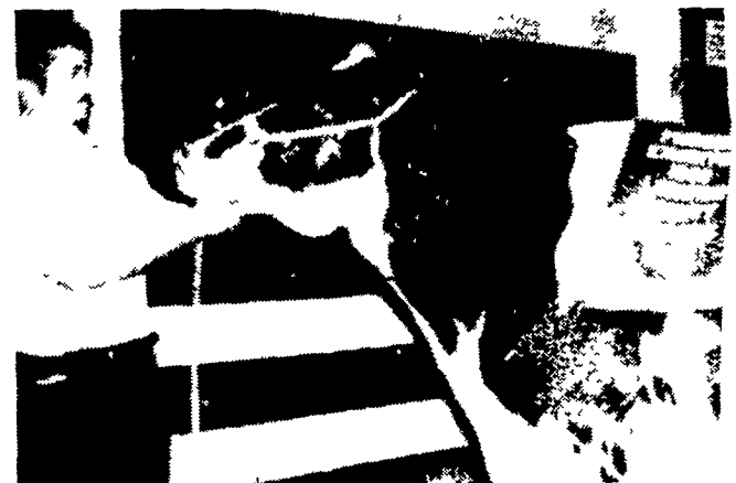
Arnold Acres was the Premier Exhibitor at this year's Open Holstein Show.