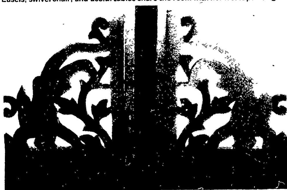
Catherine proudly pointed to the scroll work above the upstairs balcony. She clearly enjoys working with older houses.